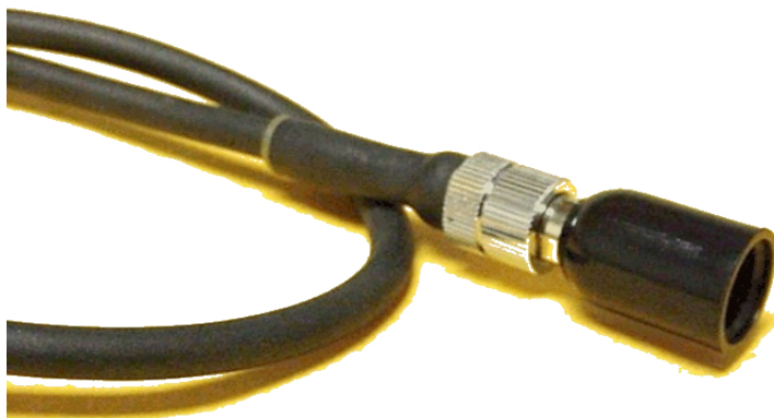
TT-MINI-PROBE connected to a TT-MLC-MC leader cable